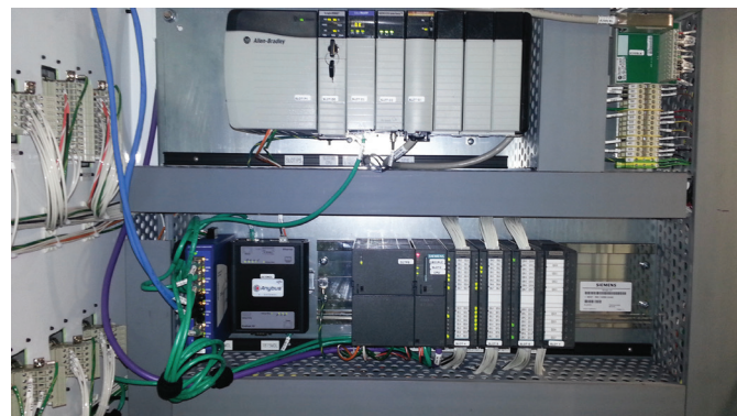
The Anybus X-gateway allows Nagel's Allen Bradley PLC to communicate with any other industrial network. The above example uses a Slave-Adapter X-gateway between the EtherNet/IP-based equipment on the top rack and the PROFINET-based equipment on the bottom rack.