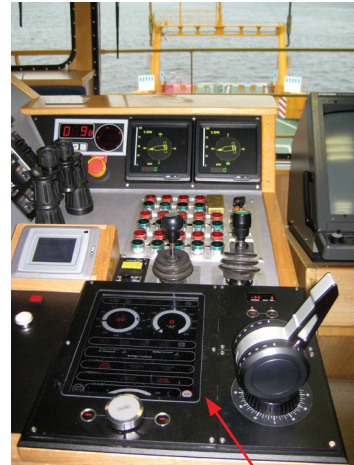
BRC 800 control system

The Anybus Communicator CAN was just that. Furthermore, we also see a trend in our business towards CAN-based communication so the Anybus solutions can become even more valuable to us in the future," concludes Tomas Holmquist.