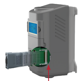
Anybus slot and 50-pin CompactFlash connector on the PCB of the host device

The CompactCom module slides into a pre-designated slot in the host automation device PCB. The module is secured with an innovative mechanism by tightening the two screws located on the front cover of the CompactCom module. HMS offers a customized CompactFlash connector for Anybus CompactCom. The module insertion can be made at any stage in the logistical chain between the automation device manufacturer and the end customer. CompactCom slot cover available on request from HMS.