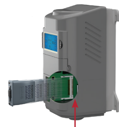
Anybus slot and 50-pin CompactFlash connector on the PCB of the host device